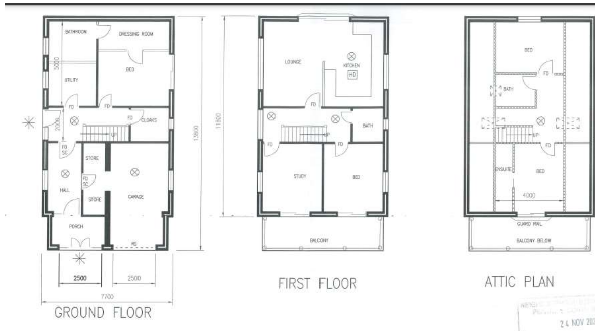
Figure : 5 Floor Plan