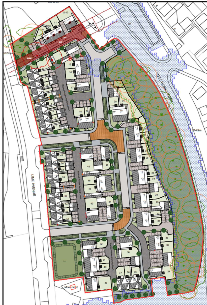
Figure 1 – Proposed Site Layout