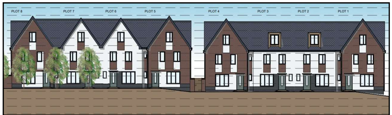
Figure 3 – Townhouse style terrace blocks fronting Lime Avenue