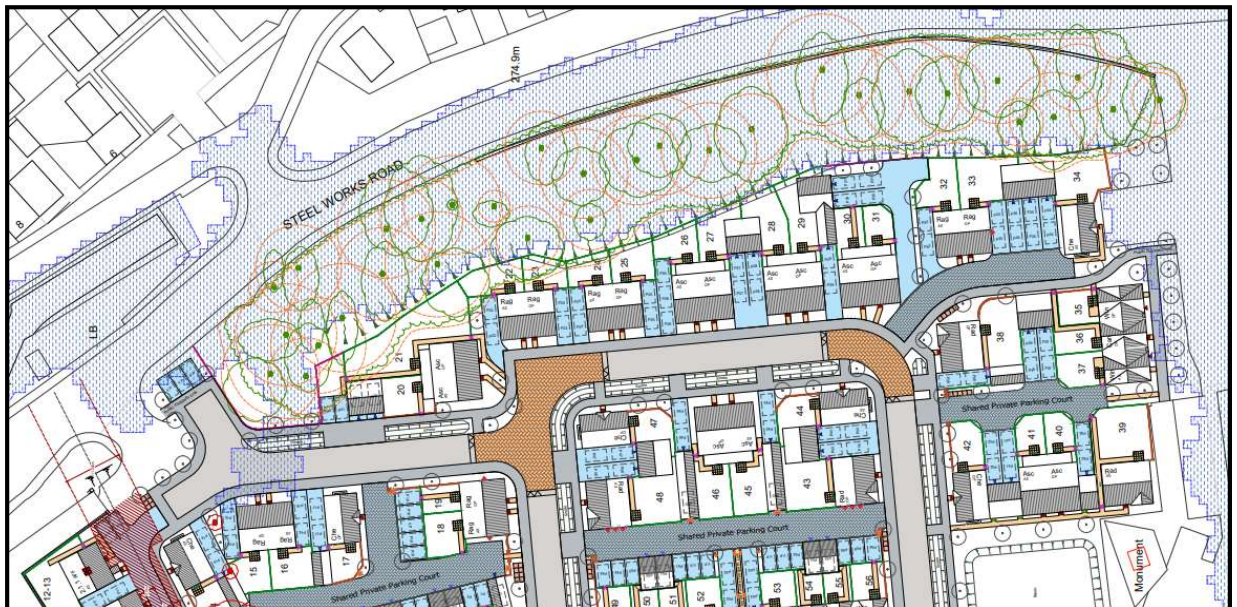
Figure 2 – Extent of Flood Zone C2 (Hatched blue)

5.5 The River Ebbw is located just to north east of the application site on the far side of Steel Works Road. The River Ebbw enters a large culvert at this location and remains culverted for a length of 160m where it subsequently discharges into an open channel south of the site. The majority of the application site, including all areas where houses are proposed to be located, falls outside of the Flood Zone C2 as defined on the Development Advice Maps that accompany the Welsh Government's Technical Advice Note 15: Development and Flood Risk (TAN 15). There are, however, certain areas of land within the application site that fall within this flood zone. In particular, the tree covered area of land that runs along the eastern boundary of the site (shown at the top of Figure 2 below, adjacent to Steel Works Road) falls within Flood Zone C2. This is primarily due to it being at a lower land level than the majority of the site that has previously been raised and re-profiled to create a development plateau (planning permission C/2009/0023 refers). No built development is proposed on this lower lying area of land.