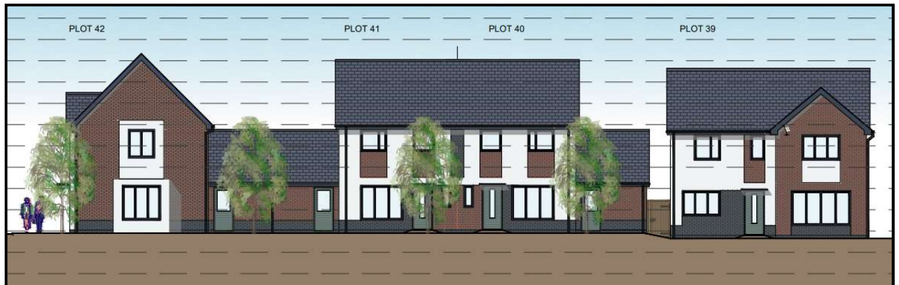
Figure 4 – Examples of proposed detached and semi-detached houses which overlook the public open space/attenuation basin located in the south-western corner of the site

providing good levels of access through the site and connectivity with nearby community facilities and services, such as the train station.